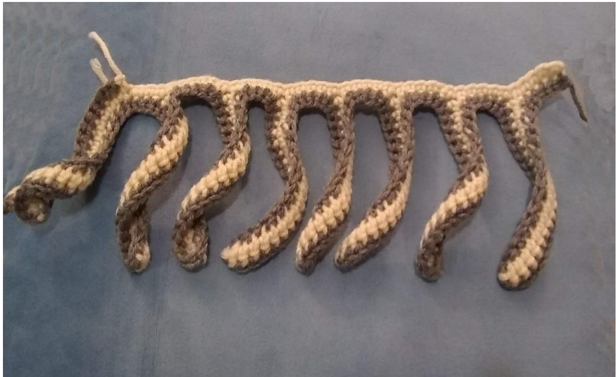
Second Stage of Tentacles Completed

Repeat until you have crocheted up and over all tentacles. Cut yarn and bind off.