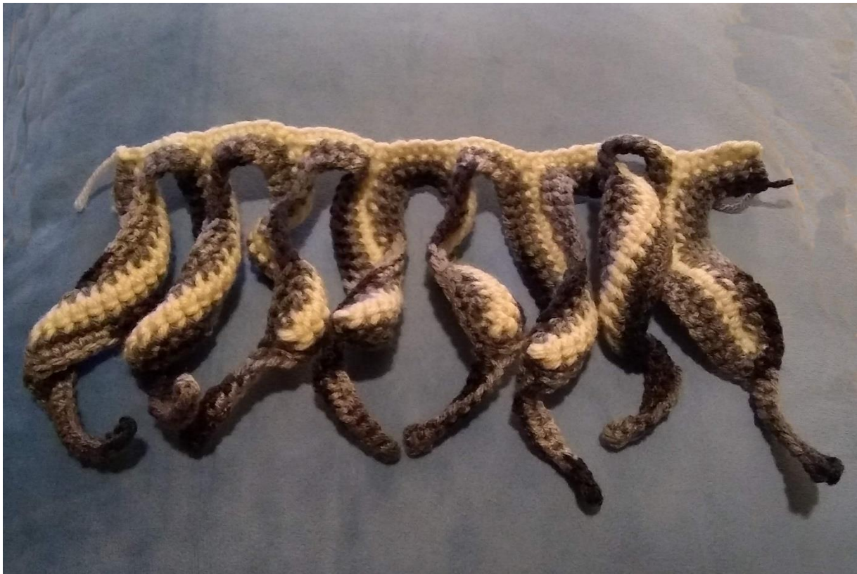
Third Stage of Tentacles Completed

When you have worked all the way across all the tentacles, cut yarn and bind off.