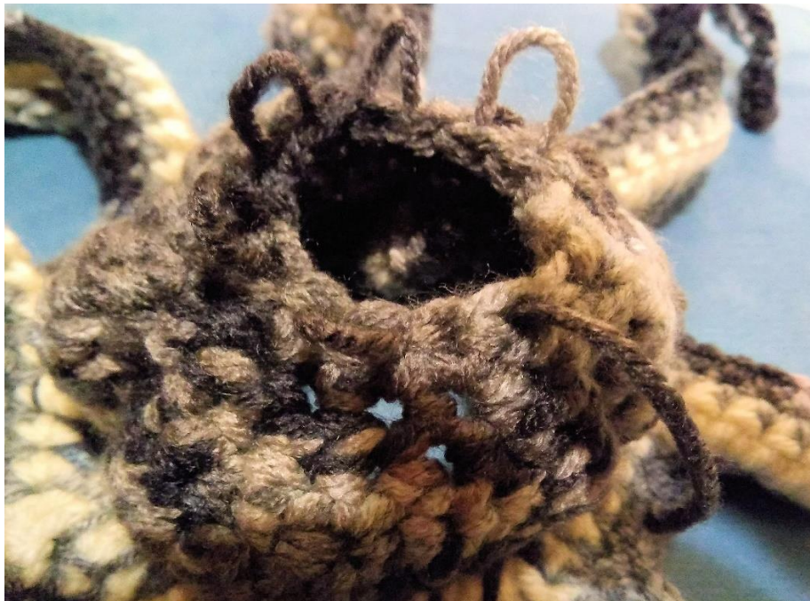
About to pull that loose thread tight to close the top of the head

Cut yarn, leaving a 6" tail. Pull the yarn-tail through each open stitch, weaving back and forth until you are back where you started. Pull the yarn to cinch the stitches closed. Knot the end tightly and pull any remaining yarn through to the inside of the head to hide it.